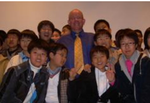
'Secrets of a Super Memory' Seminar- Seoul