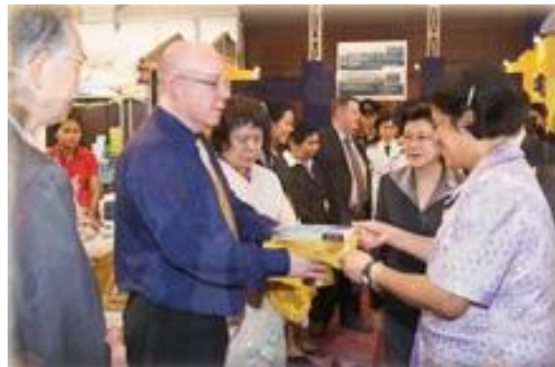
Presenting his book to HRH Princess Maha Chakri, daughter of the Thai King

He has written several books on memory which have been translated into many languages. His new book "Where did Noah Park the Ark" published by Random House in September 2010.