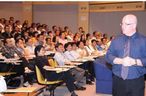
Lecture at the Bank of Bangkok, Bangkok