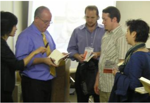
'Secrets of a Super Memory' Seminar - Tokyo