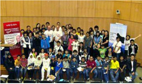
'Super Student Success Seminar - Singapore